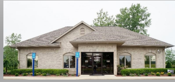
1315 Southwind Drive Michigan City, IN 46360