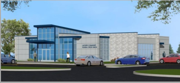
1800 E Lincolnway La Porte, IN 46350