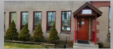
505 N Carroll Ave Michigan City, IN 46360