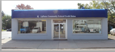
1304 Jefferson Ave La Porte, IN 46350